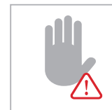
Controlled Slow Down Functionality

An operator can then continue operation of the truck, but speed is limited to one mile per hour and lift capability is disabled until the SRL is connected.